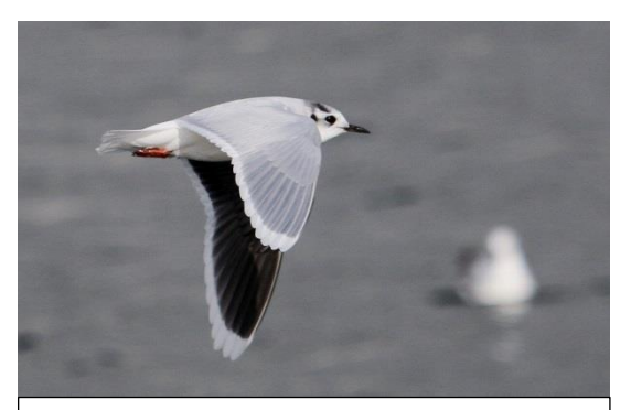
Adult and first winter Little Gull at Brooklands in 2014

The Little Gull winters at sea in the Atlantic, the Mediterranean, and the Black and Caspian Seas. They return in spring to breeding grounds in the Baltic countries, eastern Europe and Russia and breed in colonies in freshwater marshes.