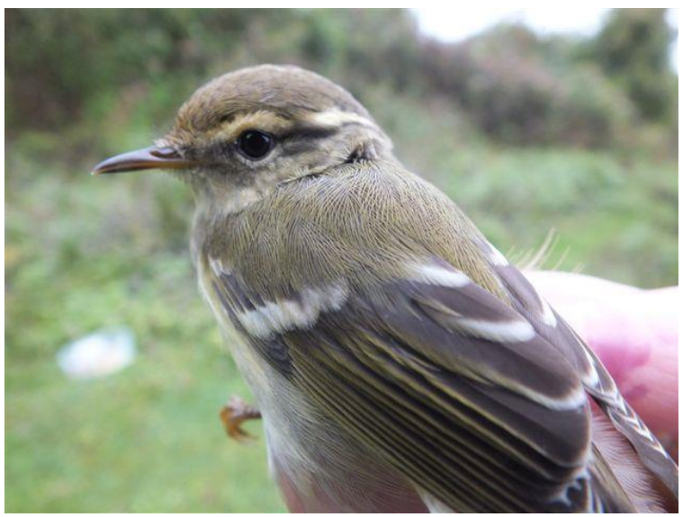
Yellow-browed Warbler in the hand at Cissbury Ring